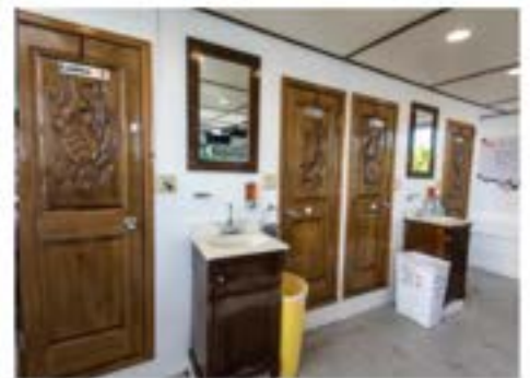
QUINO EL GUARDIAN BOAT / CABIN LAYOUT Cabin 1 & 4 have two upper and two lower bunks / Cabin 3 has one upper and one lower bunk